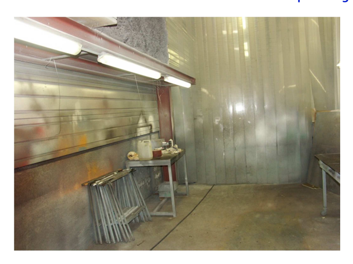
Our loading area: We have a loading bridge up to 6 tons.

We also have a painting area, in order to repaint the whole of our reconditioned machines. It's often our customers who choose the color of painting.