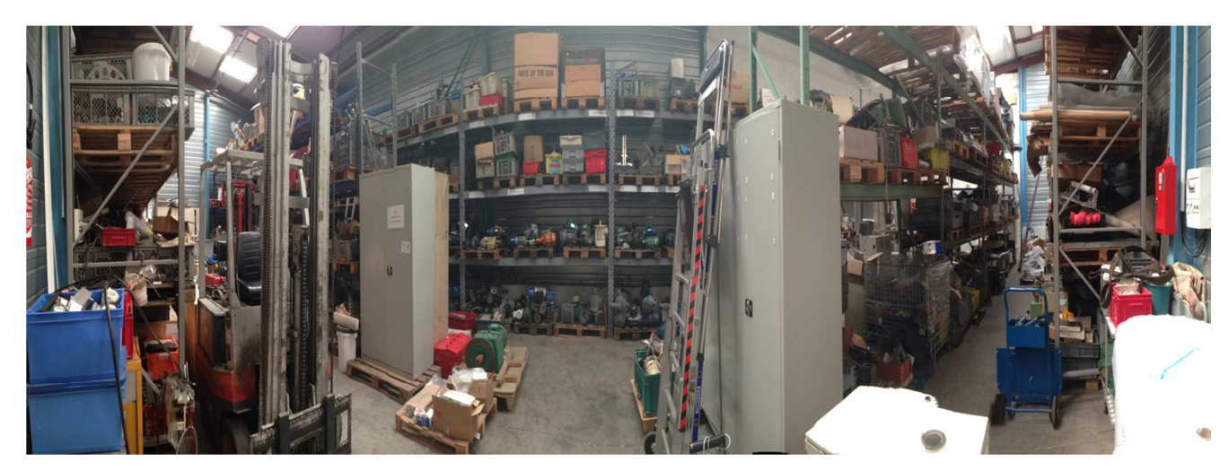
Our workshop: Our 5 technicians are highly qualified to repair the machines from top to bottom.